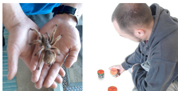
Figure 1: When designing the GlowBots we took inspiration from the relationship people develop with unusual pets such as spiders

We have also been systematically developing new design methods to see how users' interests can be transferred into novel design – in particular for robots [9]. In one case, we transferred the special relationship that some people have with unusual pets, such as snakes, lizards and spiders, to robot designs – but without transferring the anthropomorphic properties of these